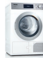
Evolution PDR 307 HP [EL]