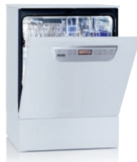
PG8581 Washer disinfector

With each PG8581 washer disinfector for dental practices, we include: