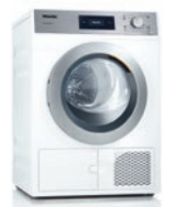
Evolution PDR 307 [EL]