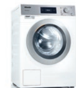
Evolution PWM 307 [EL DP]