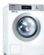
Little Giant PWM 507 [EL DV]